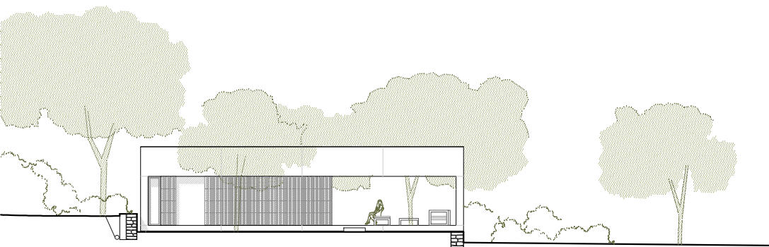
North-West elevation (annex building)